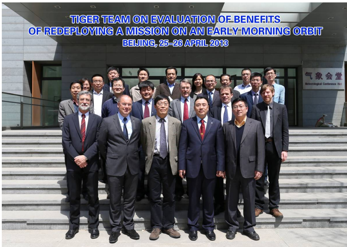
Figure 1: Participants in the Tiger Team seminar.

The report is based on the work of the Tiger Team established on this matter by the World Meteorological Organization (WMO) and CGMS. It summarizes the outcome of the Tiger Team seminar hosted by CMA in Beijing on 25 and 26 April 2013.