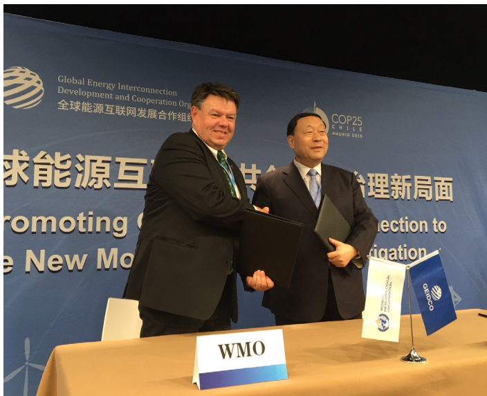
WMO Secretary-General Petteri Taalas and GEIDCO Chairman Liu Zhenya sign agreement to promote efficient, resilient renewable energy generation and use.

The agreement will enable WMO to expand the provision of climate services for energy as a contribution to the implementation of the Global Framework for Climate Services (GFCS). The occasion for the signing was the release of several reports at COP25 focused on implementation of renewable energy systems on a scale and scope sufficient to achieve the temperature target of the Paris Agreement, of keeping the global temperature increase to less than 1.5 or 2 °C above pre-industrial levels.