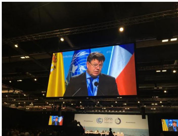
WMO Secretary-General Petteri Taalas addressing the high-level segment of the UN Climate Change Conference on 10 December

A key objective of COP25 is to raise overall ambition with respect to the full operationalization of the Paris Agreement, which aims to keep a global average temperature rise this century well below 2 °C and to drive efforts to limit the temperature increase even further to 1.5 °C above pre-industrial levels.